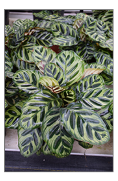
Peacock Plant in full

When grown indoors, Peacock Plant can be expected to grow to be about 24 inches tall at maturity, with a spread of 18 inches. It grows at a slow rate, and under ideal conditions can be expected to live for approximately 5 years. This houseplant should only be grown away from direct sunlight or in a room with strong artificial light. It does best in average to evenly moist soil, but will not tolerate standing water. The surface of the soil shouldn't be allowed to dry out completely, and so you should expect to water this plant once and possibly even twice each week. Be aware that your particular watering schedule may vary depending on its location in the room, the pot size, plant size and other conditions; if in doubt, ask one of our experts in the store for advice. It is not particular as to soil pH, but grows best in rich soil. Contact the store for specific recommendations on pre-mixed potting soil for this plant.