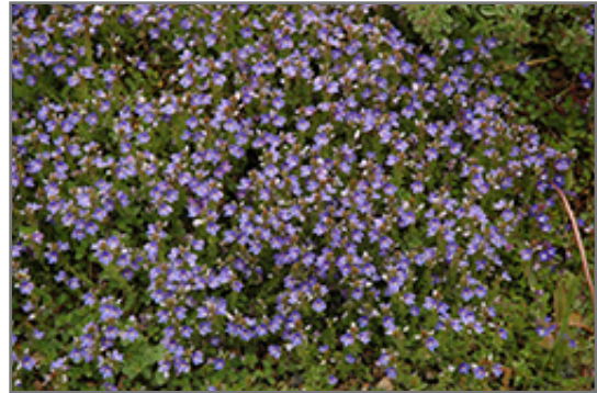
Turkish Speedwell in bloom

Turkish Speedwell is a dense herbaceous perennial with a ground-hugging habit of growth. It brings an extremely fine and delicate texture to the garden composition and should be used to full effect.