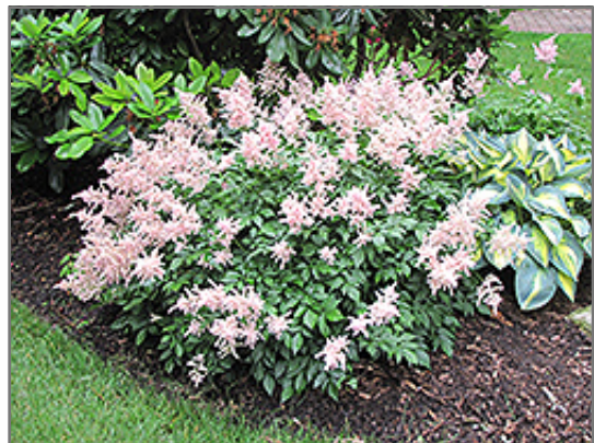
Peach Blossom Astilbe in bloom