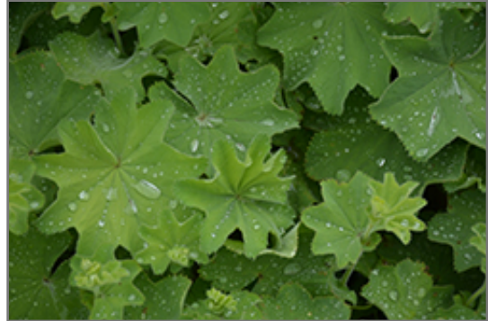
Lady's Mantle foliage

This plant performs well in both full sun and full shade. It is very adaptable to both dry and moist locations, and should do just fine under typical garden conditions. It is not particular as to soil type or pH. It is highly tolerant of urban pollution and will even thrive in inner city environments. This species is not originally from North America. It can be propagated by cuttings.