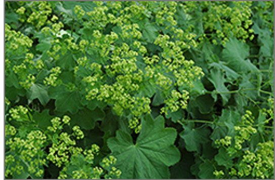
Lady's Mantle flowers

Lady's Mantle is recommended for the following landscape applications;