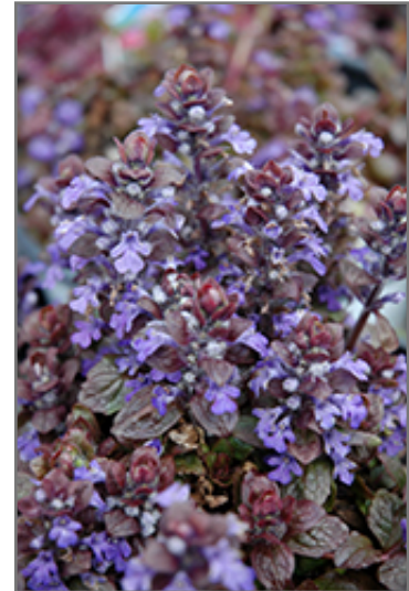
Bronze Beauty Bugleweed flowers

This plant will require occasional maintenance and upkeep, and should not require much pruning, except when necessary, such as to remove dieback. It is a good choice for attracting butterflies to your yard, but is not particularly attractive to deer who tend to leave it alone in favor of tastier treats. Gardeners should be aware of the following characteristic(s) that may warrant special consideration;