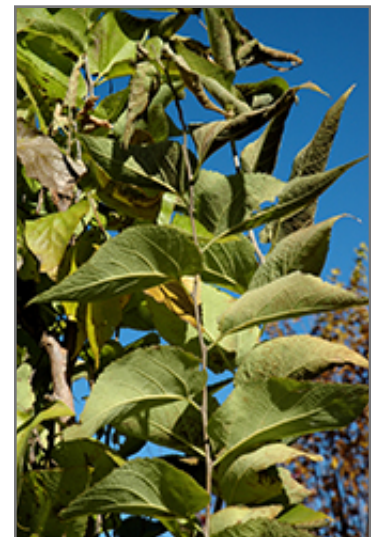
Prairie Sentinel Hackberry foliage