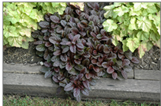
Mahogany Bugleweed