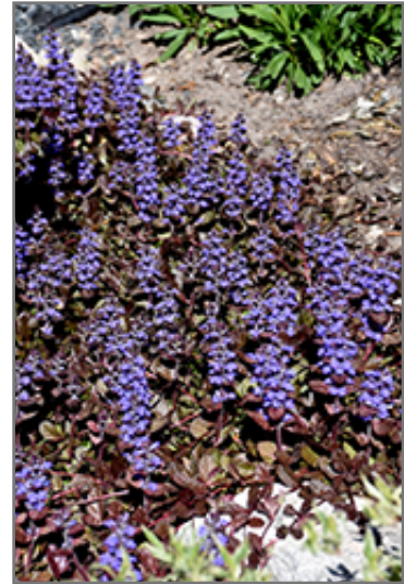
Mahogany Bugleweed flowers

Mahogany Bugleweed is a dense herbaceous evergreen perennial with a ground-hugging habit of growth. Its relatively fine texture sets it apart from other garden plants with less refined foliage.