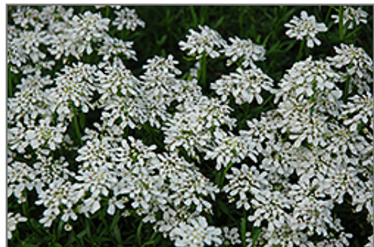
Little Gem Candytuft flowers