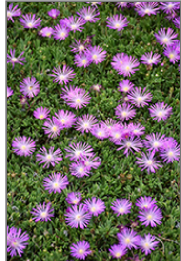
Table Mountain Ice Plant flowers

Table Mountain Ice Plant is a fine choice for the garden, but it is also a good selection for planting in outdoor pots and containers. Because of its spreading habit of growth, it is ideally suited for use as a 'spiller' in the 'spiller-thriller-filler' container combination; plant it near the edges where it can spill gracefully over the pot. Note that when growing plants in outdoor containers and baskets, they may require more frequent waterings than they would in the yard or garden. Be aware that in our climate, most plants cannot be expected to survive the winter if left in containers outdoors, and this plant is no exception. Contact our experts for more information on how to protect it over the winter months.