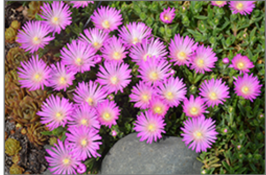
Table Mountain Ice Plant flowers

This is a relatively low maintenance plant, and is best cleaned up in early spring before it resumes active growth for the season. It is a good choice for attracting bees and butterflies to your yard. It has no significant negative characteristics.