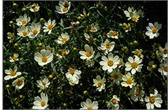
Star Cluster Tickseed flowers

Star Cluster Tickseed is recommended for the following landscape applications;