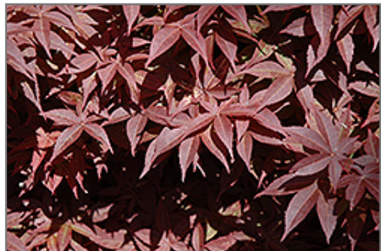
Rhode Island Red Japanese Maple foliage