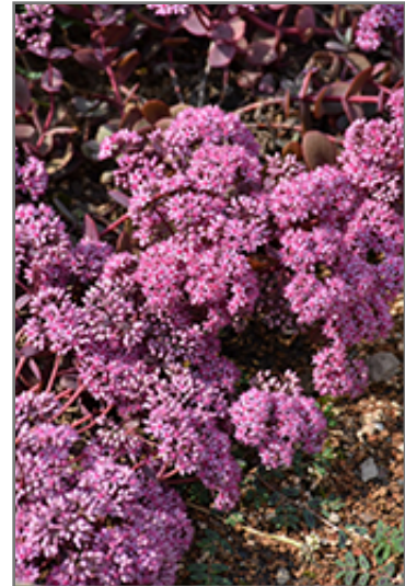
Cherry Tart Stonecrop flowers

Cherry Tart Stonecrop is a fine choice for the garden, but it is also a good selection for planting in outdoor pots and containers. It is often used as a 'filler' in the 'spiller-thriller-filler' container combination, providing a mass of flowers and foliage against which the larger thriller plants stand out. Note that when growing plants in outdoor containers and baskets, they may require more frequent waterings than they would in the yard or garden. Be aware that in our climate, most plants cannot be expected to survive the winter if left in containers outdoors, and this plant is no exception. Contact our experts for more information on how to protect it over the winter months.