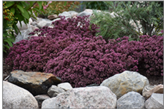
Cherry Tart Stonecrop in bloom

Cherry Tart Stonecrop is a dense herbaceous perennial with an upright spreading habit of growth. Its medium texture blends into the garden, but can always be balanced by a couple of finer or coarser plants for an effective composition.