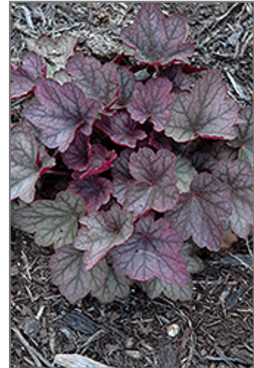
Carnival Rose Granita Coral Bells foliage

Carnival Rose Granita Coral Bells is recommended for the following landscape applications;