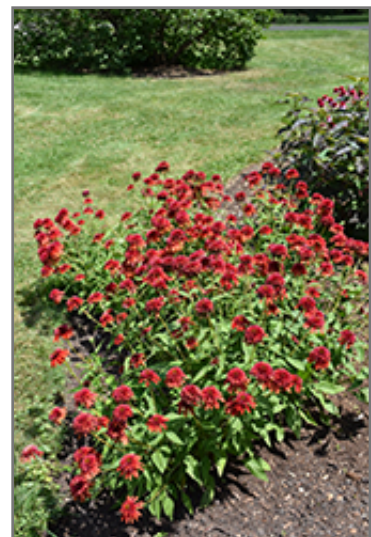
Double Scoop Orangeberry Coneflower in bloom

Ottawa West 2079 Carp Road Ottawa, Ontario, Canada K2S 1B9 Telephone: +1 613 836 6880