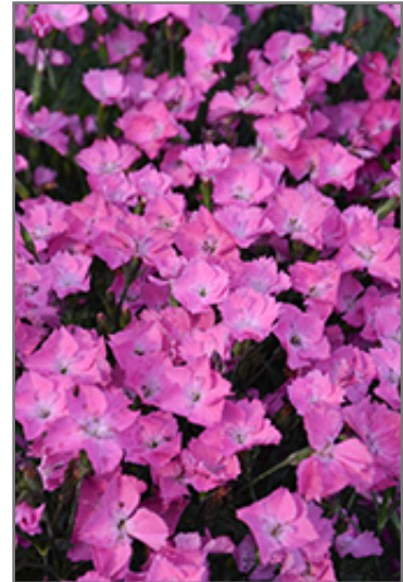
Beauties Kahori Pink Pinks flowers

This is a relatively low maintenance plant, and is best cleaned up in early spring before it resumes active growth for the season. It is a good choice for attracting bees and butterflies to your yard, but is not particularly attractive to deer who tend to leave it alone in favor of tastier treats. It has no significant negative characteristics.