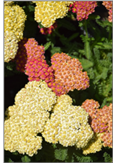
Desert Eve Terracotta Yarrow flowers