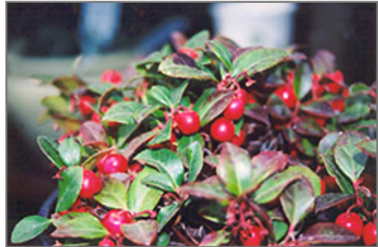
Creeping Wintergreen fruit

Creeping Wintergreen is a spreading evergreen shrub with a ground-hugging habit of growth. Its relatively fine texture sets it apart from other landscape plants with less refined foliage.