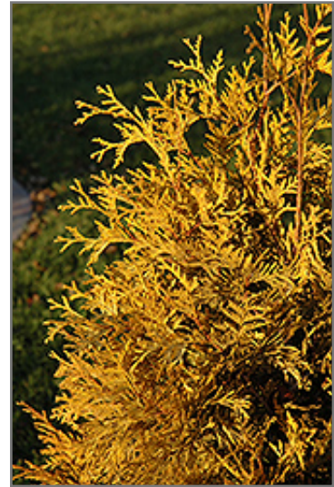
Yellow Ribbon Arborvitae in fall

This shrub does best in full sun to partial shade. It prefers to grow in average to moist conditions, and shouldn't be allowed to dry out. It is not particular as to soil type or pH. It is somewhat tolerant of urban pollution, and will benefit from being planted in a relatively sheltered location. Consider applying a thick mulch around the root zone in winter to protect it in exposed locations or colder microclimates. This is a selection of a native North American species.