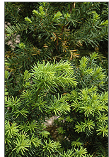
Hicks Yew foliage