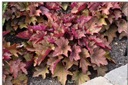
Carnival Watermelon Coral Bells