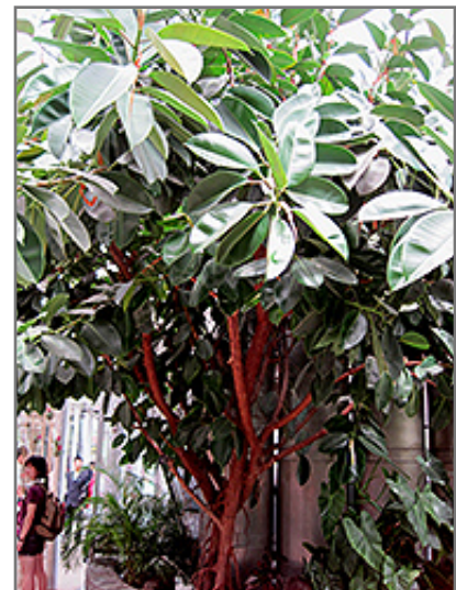
Rubber Tree