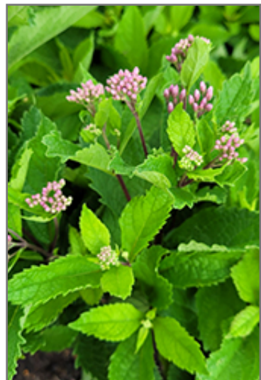
Phantom Joe Pye Weed flower buds