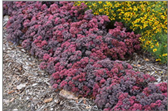
Dazzleberry Stonecrop in bloom