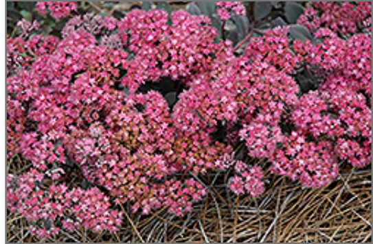
Dazzleberry Stonecrop flowers

Dazzleberry Stonecrop is a dense herbaceous perennial with an upright spreading habit of growth. Its medium texture blends into the garden, but can always be balanced by a couple of finer or coarser plants for an effective composition.