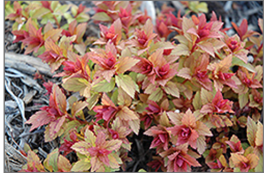
Magic Carpet Spirea foliage