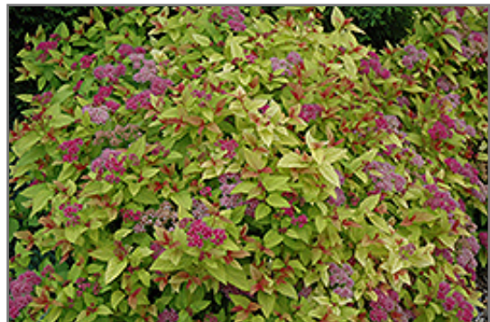
Magic Carpet Spirea flowers