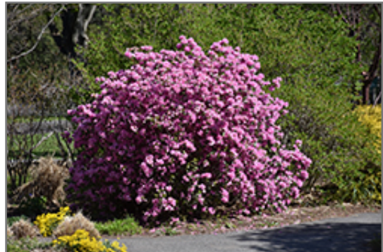
P.J.M. Elite Rhododendron in bloom