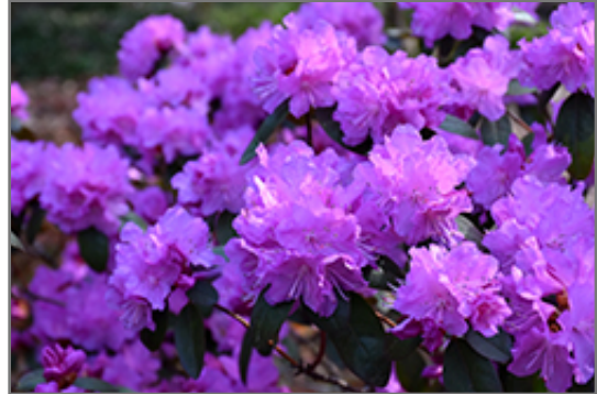
P.J.M. Elite Rhododendron flowers

This is a relatively low maintenance shrub, and should only be pruned after flowering to avoid removing any of the current season's flowers. It has no significant negative characteristics.