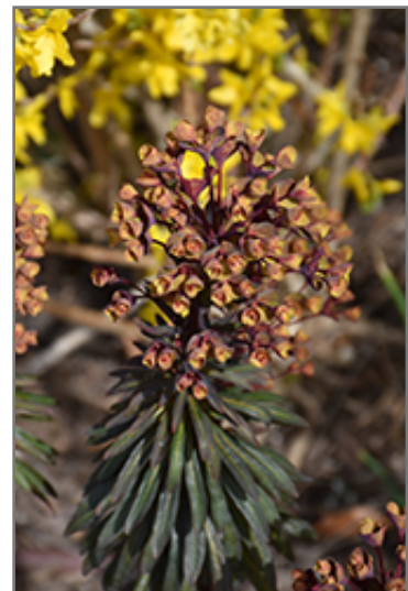
Purple Wood Spurge flower buds