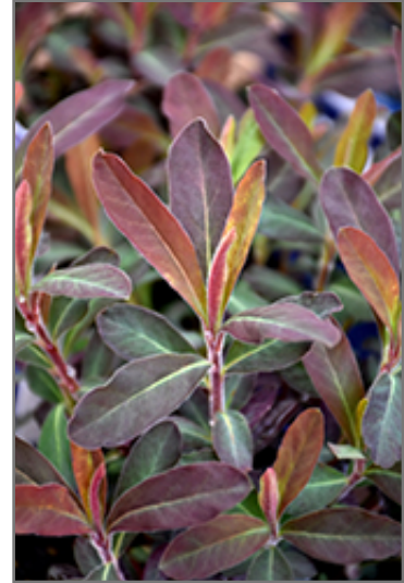
Purple Wood Spurge foliage

Purple Wood Spurge is a fine choice for the garden, but it is also a good selection for planting in outdoor pots and containers. It is often used as a 'filler' in the 'spiller-thriller-filler' container combination, providing a mass of flowers and foliage against which the thriller plants stand out. Note that when growing plants in outdoor containers and baskets, they may require more frequent waterings than they would in the yard or garden. Be aware that in our climate, most plants cannot be expected to survive the winter if left in containers outdoors, and this plant is no exception. Contact our experts for more information on how to protect it over the winter months.