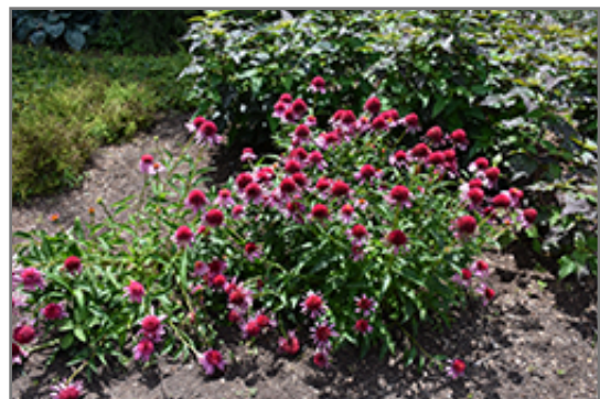
Double Scoop Bubble Gum Coneflower in bloom