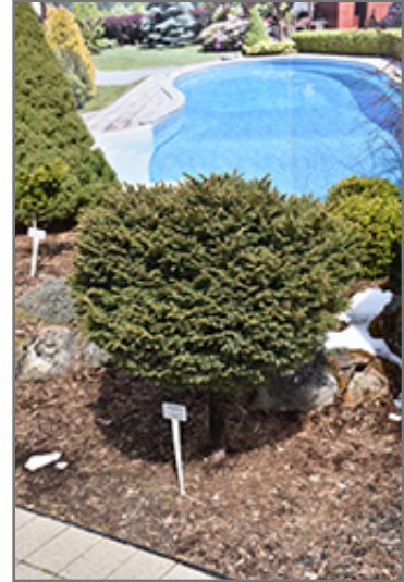
Little Gem Spruce (tree form)