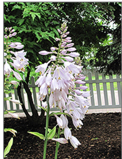
Key West Hosta flowers