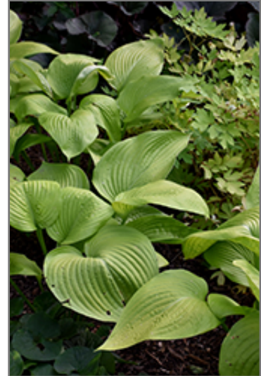
Key West Hosta

This plant does best in partial shade to shade. It prefers to grow in average to moist conditions, and shouldn't be allowed to dry out. It is not particular as to soil type or pH. It is somewhat tolerant of urban pollution. This particular variety is an interspecific hybrid. It can be propagated by division; however, as a cultivated variety, be aware that it may be subject to certain restrictions or prohibitions on propagation.