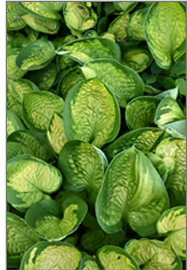
Rainforest Sunrise Hosta foliage