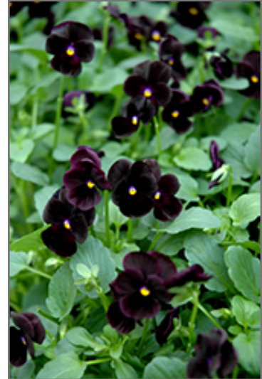
Sorbet Black Delight Pansy flowers

Sorbet Black Delight Pansy is an herbaceous perennial with a mounded form. Its relatively fine texture sets it apart from other garden plants with less refined foliage.