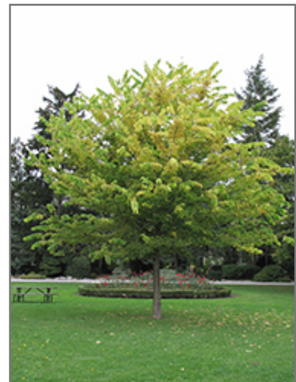
Common Hackberry in fall