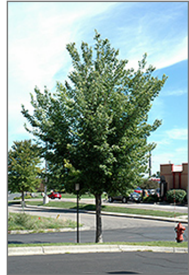
Common Hackberry