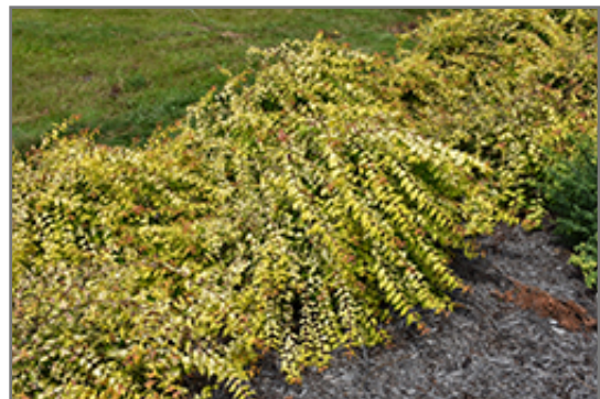
Dream Catcher Beautybush