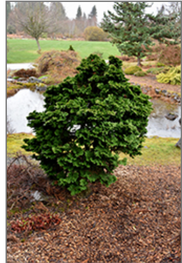
Dwarf Hinoki Falsecypress