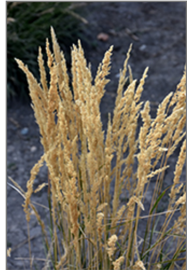
El Dorado Feather Reed Grass fruit

El Dorado Feather Reed Grass is a fine choice for the garden, but it is also a good selection for planting in outdoor pots and containers. Because of its height, it is often used as a 'thriller' in the 'spiller-thriller-filler' container combination; plant it near the center of the pot, surrounded by smaller plants and those that spill over the edges. It is even sizeable enough that it can be grown alone in a suitable container. Note that when growing plants in outdoor containers and baskets, they may require more frequent waterings than they would in the yard or garden. Be aware that in our climate, most plants cannot be expected to survive the winter if left in containers outdoors, and this plant is no exception. Contact our experts for more information on how to protect it over the winter months.