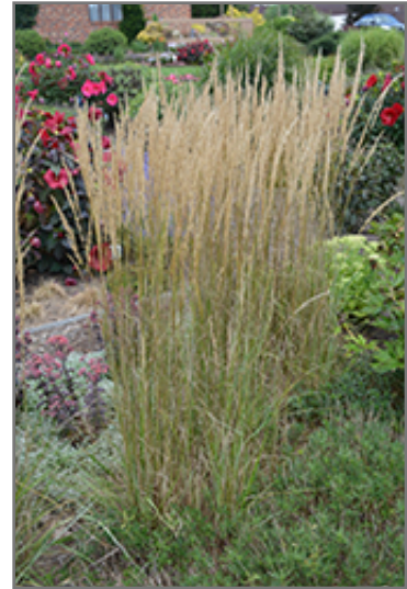
El Dorado Feather Reed Grass

El Dorado Feather Reed Grass is recommended for the following landscape applications;