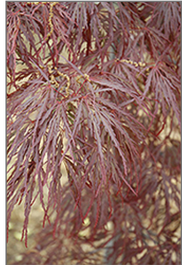
Garnet Cutleaf Japanese Maple foliage

This is a relatively low maintenance shrub, and should only be pruned in summer after the leaves have fully developed, as it may 'bleed' sap if pruned in late winter or early spring. It has no significant negative characteristics.