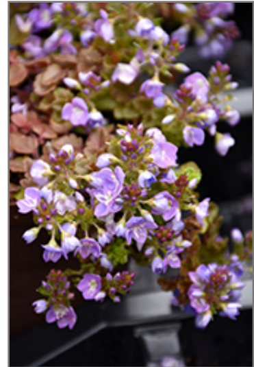
Crystal River Speedwell flowers

Crystal River Speedwell is recommended for the following landscape applications;