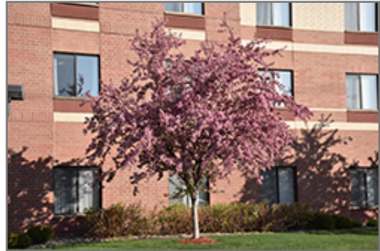
Robinson Flowering Crab in bloom

Robinson Flowering Crab is a deciduous tree with an upright spreading habit of growth. Its average texture blends into the landscape, but can be balanced by one or two finer or coarser trees or shrubs for an effective composition.