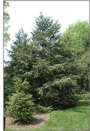
Canadian Hemlock