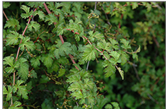
Cutleaf Stephanandra foliage

Ottawa West 2079 Carp Road Ottawa, Ontario, Canada K2S 1B9 Telephone: +1 613 836 6880