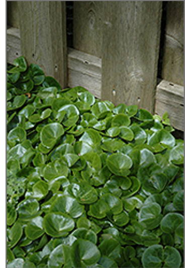
European Wild Ginger

European Wild Ginger is recommended for the following landscape applications;