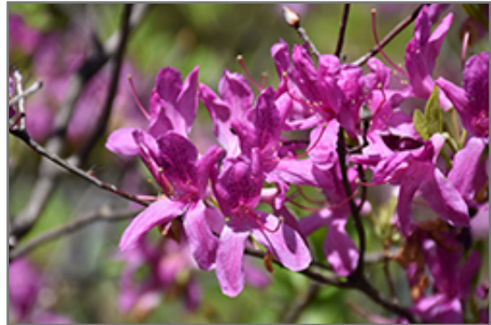
Lilac Lights Azalea flowers

Lilac Lights Azalea is recommended for the following landscape applications;