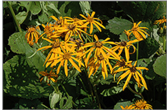
Othello Rayflower flowers