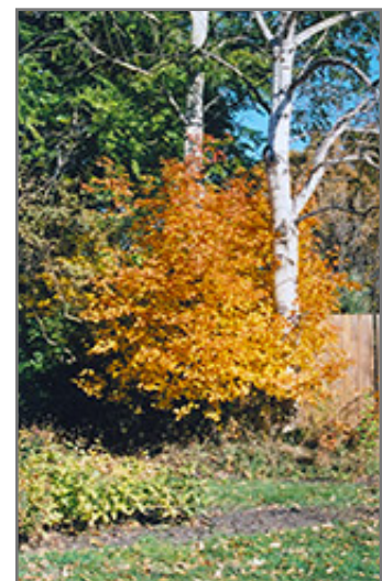
Saskatoon in fall

Ottawa West 2079 Carp Road Ottawa, Ontario, Canada K2S 1B9 Telephone: +1 613 836 6880