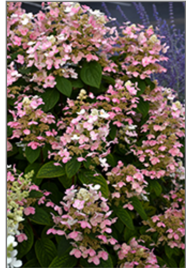
Quick Fire Hydrangea flowers

Quick Fire Hydrangea is recommended for the following landscape applications;