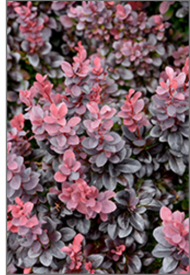
Concorde Japanese Barberry foliage