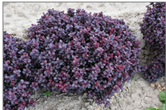
Concorde Japanese Barberry