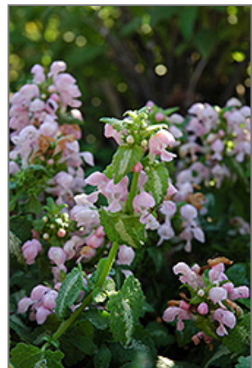
Shell Pink Spotted Dead Nettle flowers