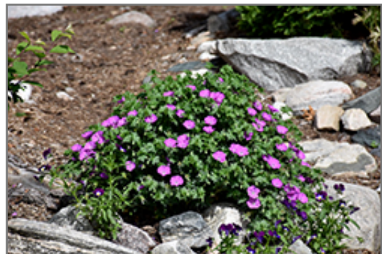
Bloody Cranesbill in bloom

Ottawa West 2079 Carp Road Ottawa, Ontario, Canada K2S 1B9 Telephone: +1 613 836 6880