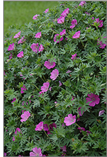
Bloody Cranesbill flowers

Bloody Cranesbill is a dense herbaceous perennial with a mounded form. It brings an extremely fine and delicate texture to the garden composition and should be used to full effect.