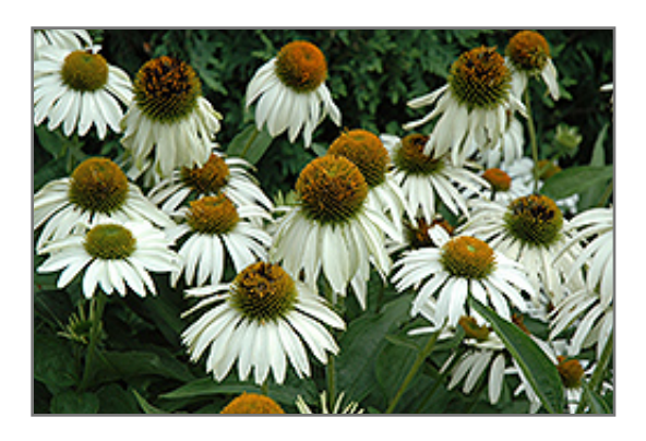
White Swan Coneflower flowers

White Swan Coneflower is an herbaceous perennial with an upright spreading habit of growth. Its medium texture blends into the garden, but can always be balanced by a couple of finer or coarser plants for an effective composition.