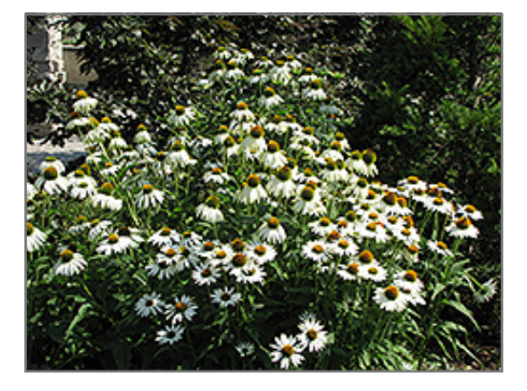
White Swan Coneflower in bloom

This is a relatively low maintenance plant, and is best cleaned up in early spring before it resumes active growth for the season. It is a good choice for attracting butterflies to your yard, but is not particularly attractive to deer who tend to leave it alone in favor of tastier treats. It has no significant negative characteristics.