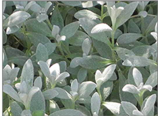
Snow-In-Summer foliage

Snow-In-Summer will grow to be about 8 inches tall at maturity, with a spread of 24 inches. Its foliage tends to remain low and dense right to the ground. It grows at a fast rate, and under ideal conditions can be expected to live for approximately 10 years.